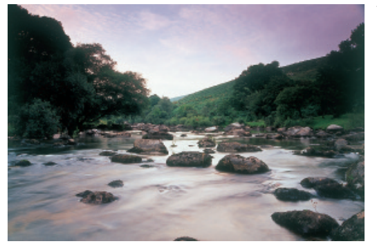
The River Dart at Dartmeet,