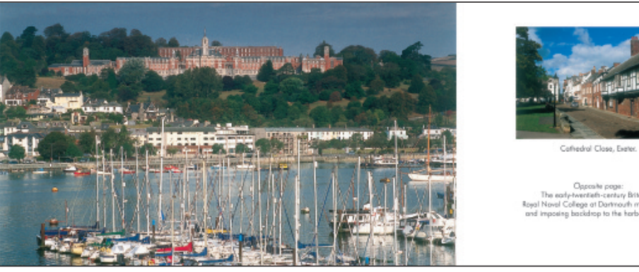
Some examples of double page spreads.