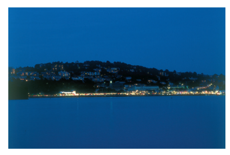
Twinkling lights of Torbay at night.