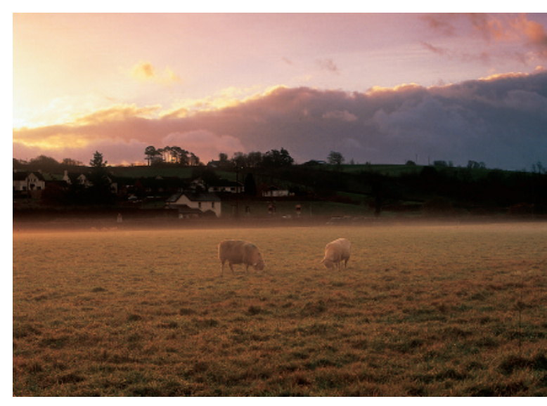
A misty morning at Umberleigh in the Taw Valley, near South Molton.